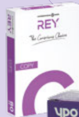
110787 Rey Copy Paper White A4 80Gsm