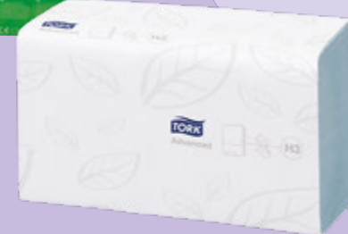
217654 Tork Singlefold Hand Towel 2Ply Blue