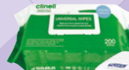
49092X Clinell Universal Sanitising Wipes