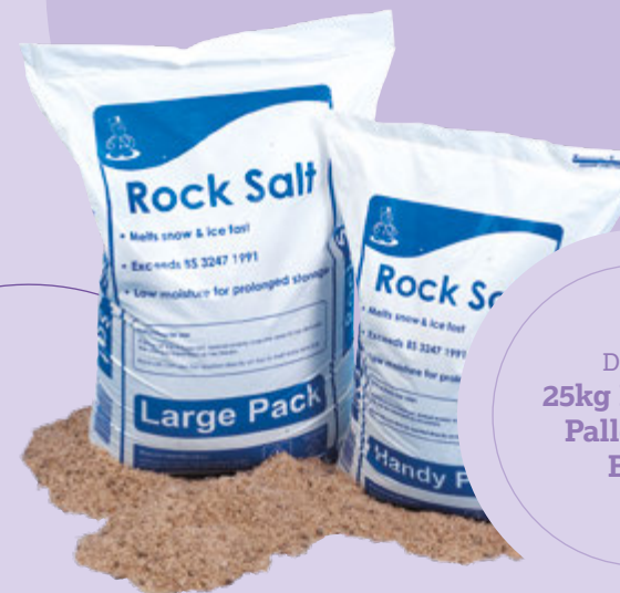
D62487 25kg Rocksalt Pallet of 40 Bags