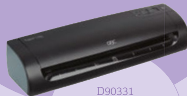
D90331 Gbc Fusion 1100L A3 Pouch Laminator